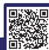
Scan QR code for more information